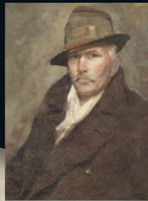
Self-Portrait (William Scouler Collection)