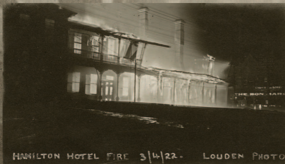
HAMILTON HOTEL FIRE 3/4/22