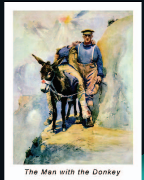
The Man with the Donkey

For New Zealanders, Gallipoli in 1915 was disastrous yet out of this battlefield arose a sense of nationhood beyond the British Empire. For the Turks, Gallipoli was also the eve of a new era beyond the Ottoman Empire, leading to the birth of the Republic in 1923.