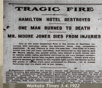
Waikato Times 3.4.1922