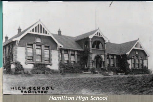
Hamilton High School